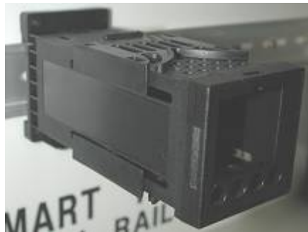
9100 mounted to DIN Rail

The 9100 integral DIN Rail Mount option Part # RK91-1 $10 List