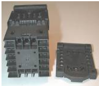
Snap on option

This option is specified as part of the unit's part number and is shown on the last component of the part number matrix, codes 2 or 3. Code 3 includes optional splash proof IP65 [Nema 4x].